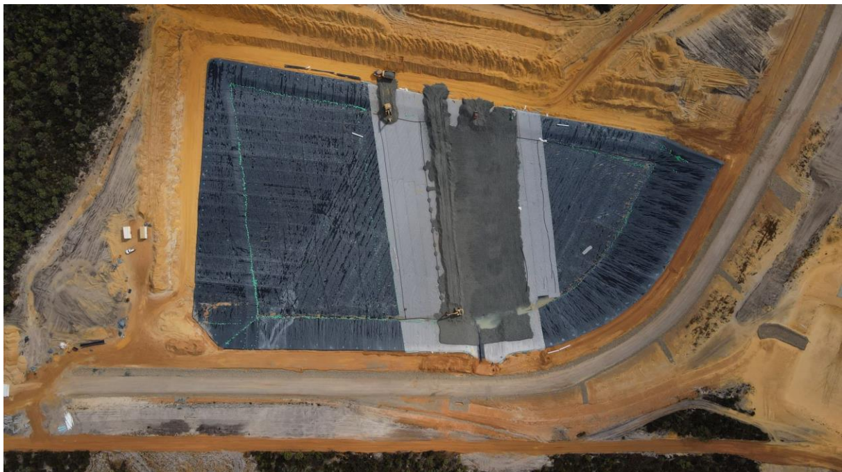
Figure 2: Cell 1 works