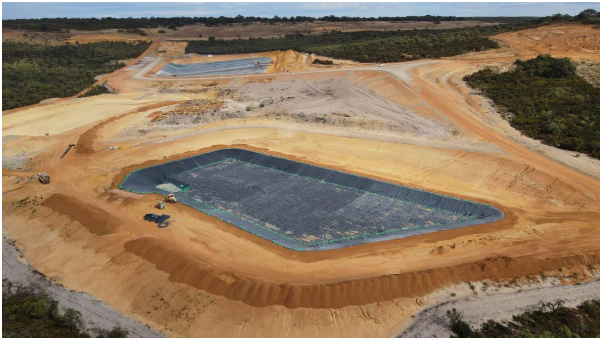
Figure 4: Leachate Recirculation Pond