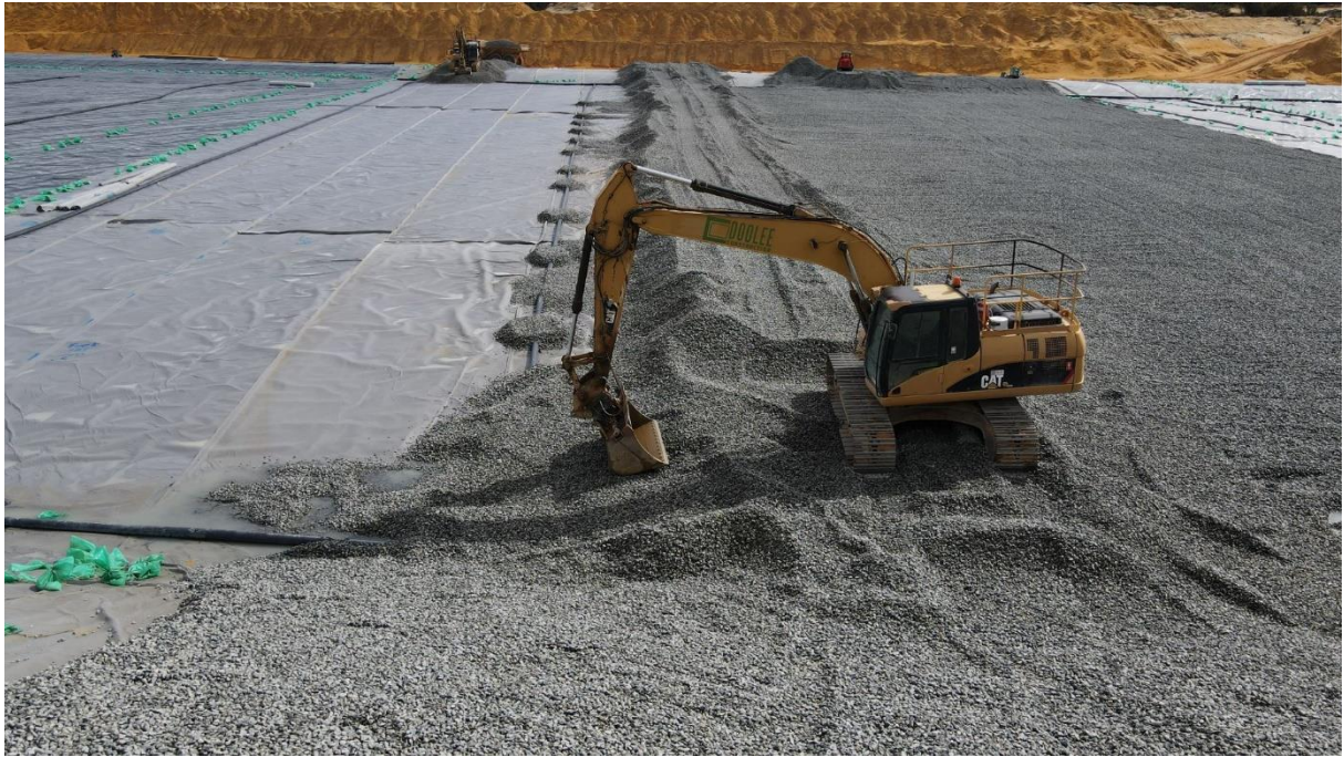
Figure 3: Cell 1 Drainage Aggregate & Leachate Recirculation pipework installation