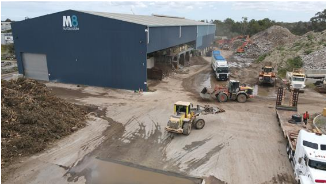
Figure 3: Maddington Waste Facility