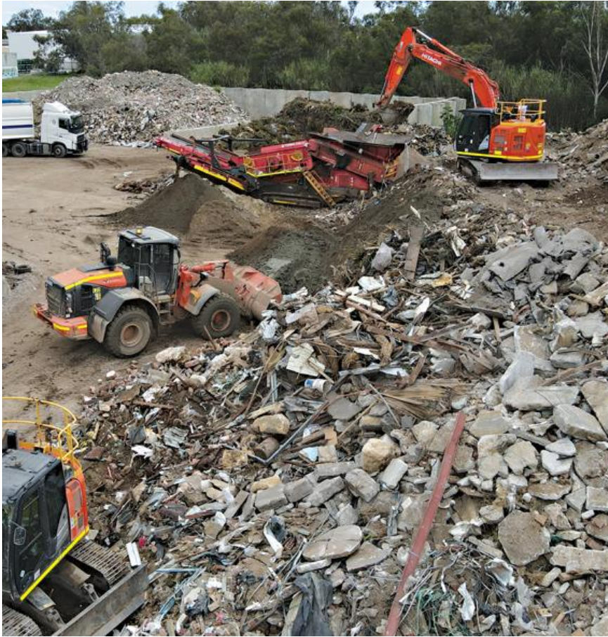
Figure 2: Maddington Waste Facility