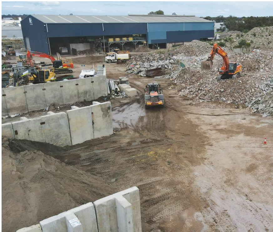
Figure 1: Maddington Waste Facility